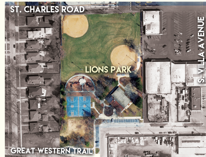
Figure 1: Possible Location

The location being discussed for a Pool &/or Recreation Center is Lions Park. Lions Park was donated to the Village by the Lions Club. Geographically, it is centrally located — convenient for all residents. The park is adjacent to the Great Western Trail and a few blocks from the Illinois Prairie Path and the Salt Creek Greenway Trail. Lions Park is easily accessible from major roads.