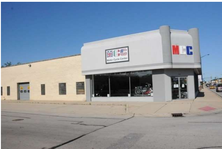
Oakland Avenue frontage