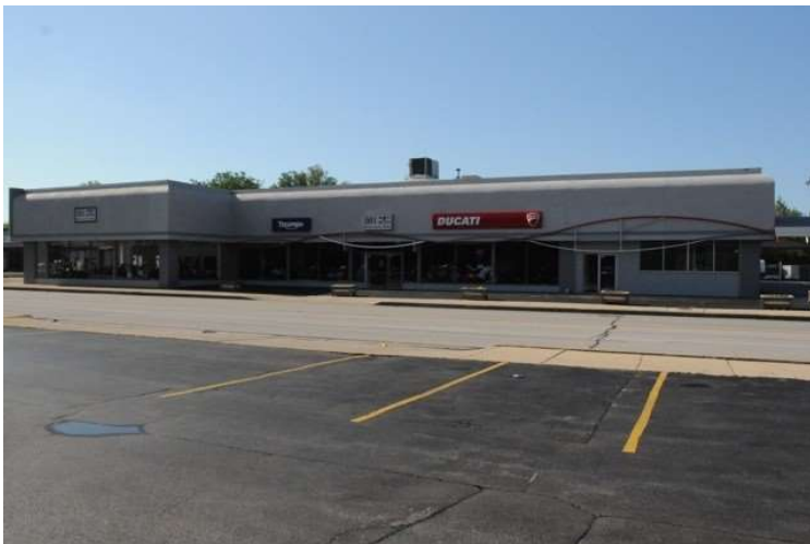
Saint Charles frontage