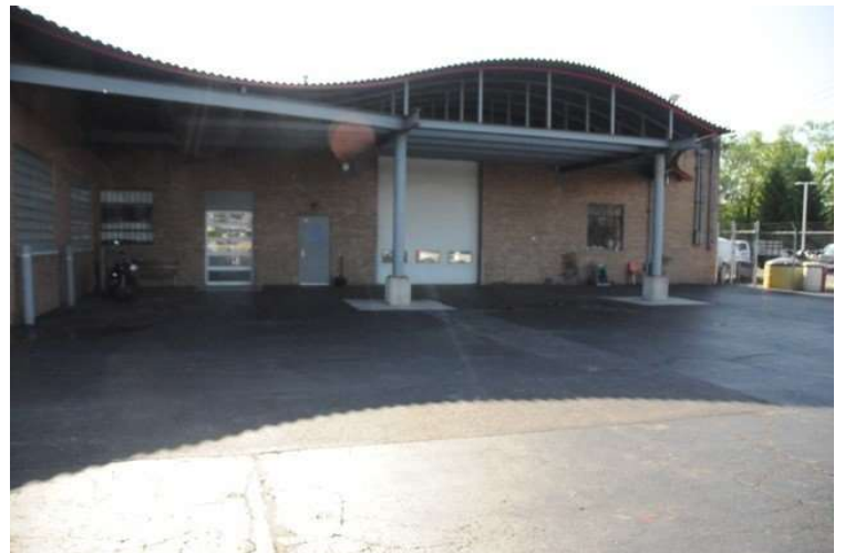
Drive in door